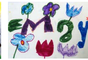
By Ariana, grade 2